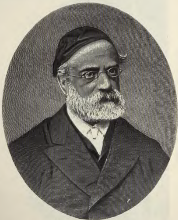
SAMSON RAPHAEL, HIRSCH

Late Rabbi of the Israelitische Religionsgesellschaft (Israelitish Society for Religion) of Frankfort-on-the-Main, Germany