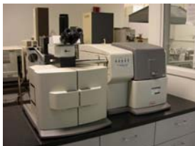
Bench Raman spectrometer