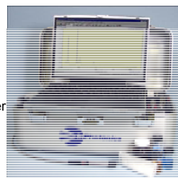
Portable Raman spectrometer